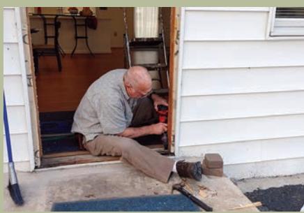
Meticulous work by mission team members has gone into almost every foot of the Pennsylvania Mission House in Harrisburg – inside and out.