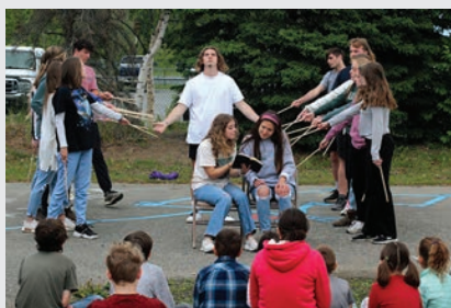
Students from Pitts Baptist in Concord convey the Gospel through performance of a powerful skit in a local park.