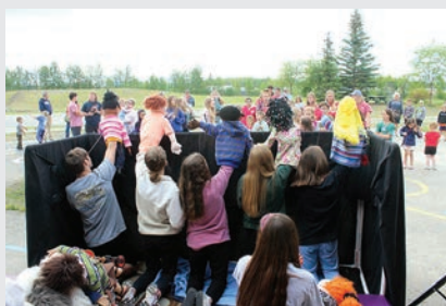
Pitts Baptist team conducts an evangelistic puppet show in a local park in Wasilla, Alaska.