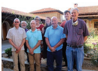
A team from the Winston-Salem area was the first international team sent by Baptists on Mission in over thirteen months. In all, ten teams served in Guatemala in 2021. More on tap for 2022.