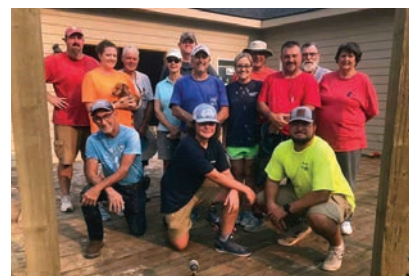
Church members from the Eastern Baptist Association were among eleven teams who served in St. Regis, Montana constructing a much needed new parsonage for the New Day Fellowship.

Cook and Maintenance teams of 8-12 volunteers will be needed to serve at our partner Baptist Camps in Wyoming and New Mexico in 2022! Please call 1-800-395-5102 x 5607 or e-mail mabernathy@ncbaptist.org to receive a projects list or secure a project for your church. You can also go to our website at www.baptistsonmission.org (Mission Projects/United States/Rocky Mountain).