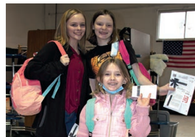
Smiling faces say it all. Won't you and your church help us reach our statewide goal of 19,000 Appalachian Christmas Outreach backpacks in 2022?