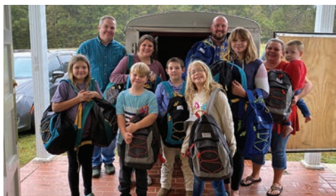
Red Bud Baptist Church in Castalia NC was one of hundreds of North Carolina churches who collected and filled over 18,600 Christmas backpacks in 2021.