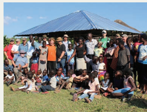
The village comes together along with team members at the end of the day in joyous celebration to dedicate the newly-built house to the Lord.

A trip to Kenya and participation in the Houses of Hope ministry can be arranged almost any time during the year. Teams can be as small as 5-6 volunteers or as large as 14-16. Simply