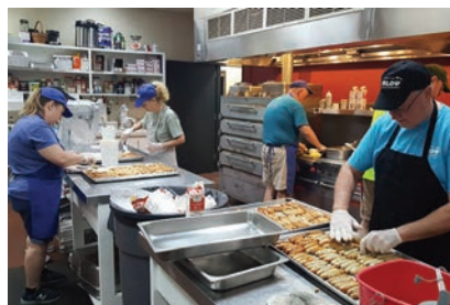
Cook and maintenance teams will also be needed at the Inlow Baptist camp in New Mexico in 2022. Let Baptists on Mission know if you can put a team together to serve!