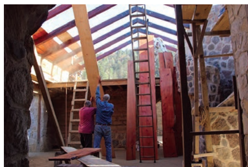
The main project this year is completion of the Mae Chosen Family Home, which will provide a stable living environment for older children from the Good Shepherd Children's Home.