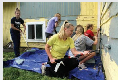
A team from South Oak Ridge in Yadkin, NC totally renovated a parsonage in Kenai, Alaska.