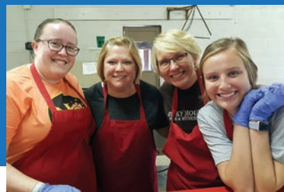
In 2021, smiling North Carolina faces once again greeted campers at the Mountaintop Baptist Assembly in Casper! You and your team can be a part of this blessing in 2022!

Finally, New Mexico has been a steady partner in utilizing mission volunteers over the years. Inlow Baptist Camp underwent a recent leadership change – thankfully, COVID shut down its operations in the same year. In 2022 we will need a full slate of cook and maintenance teams to serve at this lovely, remote camp in the Monzono mountains of Central New Mexico. Teams will enjoy playing an integral part of camp life, their efforts making it financially possible for hundreds of children and youth to attend summer camp. This may be just the place God is calling you and your team! Call the BOM office if you can help.