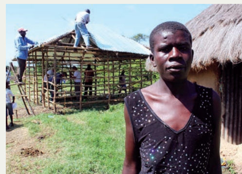
The Houses of Hope project in Kenya provides mission teams an opportunity to provide a house for a widow or family in need. It is also a church planting movement through with Bible Studies and churches are started in new areas.

Teams can serve through the Houses of Hope project throughout the year. Visit our website at www.baptistsonmission.org to find out more about this life-changing opportunity. (Mission Projects/Outside US/ Kenya). Or call 919-459-5607 or e-mail mabernathy@ncbaptist.org to secure a mission date for your church or group.