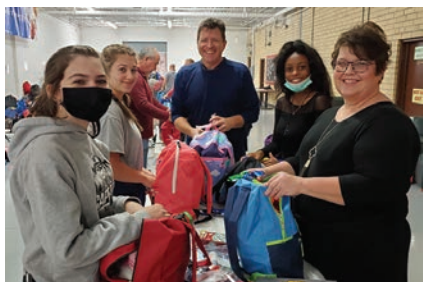
ACO Processing Day at Red Springs and Shelby is a tiring, but very rewarding experience! Thanks to all who helped!