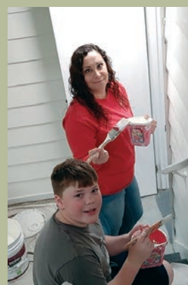
Volunteer team members add tender loving care to the facelift of the Pennsylvania Mission House, which serves as a great ministry tool in Central Pennsylvania.

One of the biggest challenges national mission teams face is answering the question, “Where are we going to stay?” While most teams are flexible enough and more than willing to sleep on the floor of the host church, it is nice to have a real bed to sleep in after a long day of mission work! Teams serving in Baptists on Mission’s partner state of Pennsylvania have the wonderful opportunity of reserving space at the Volunteer Mission House in Harrisburg. The house is owned and operated by the Baptist Recourse Network of Pennsylvania/South Jersey. It plays a key part in mission work in the Northeastern part of our nation. The house provides strategic lodging for missionaries, pastors, and mission teams serving in Pennsylvania. It also is a convenient halfway stopover for teams traveling to – or returning from – our partner area of New England.