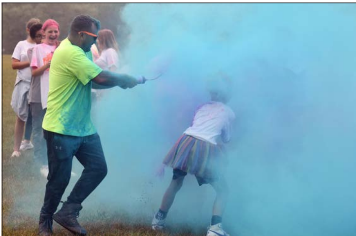
ALL ONTARIO MIDDLE SCHOOL students participated in a color run at Marshall Park. Students ran the cross country course for about a mile. Along the route, runners had colored powder thrown at them. By the end of the race, students were multi-colored and out of breath.