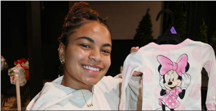
ONTARIO'S WARRIOR LEADERSHIP COUNCIL helped with Crossroad's Adopt-A-Child program, which serves over 1,000 local children.