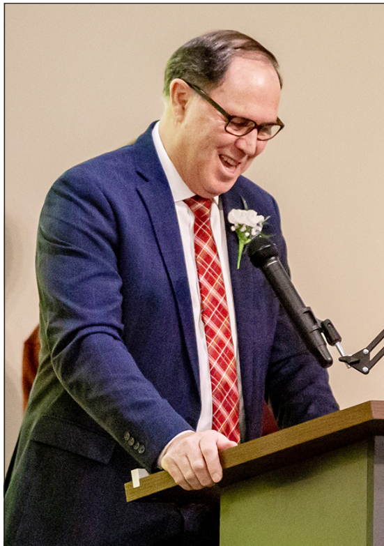
City of Shelby Mayor Steve Schag