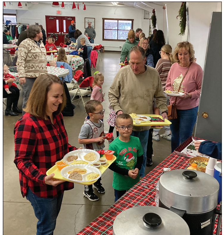
THE RICHLAND RURAL LIFE CENTER, 969 E. Crall Rd., hosted its 4th Annual Santa Breakfast on Saturday, Dec. 7. The meal included all you can eat pancakes with scrambled eggs, sausage, fruit and beverages. Children were encouraged to write a letter to Santa and had the opportunity to meet him and take photos. Following breakfast, visitors decorated cookies in Santa's workshop.