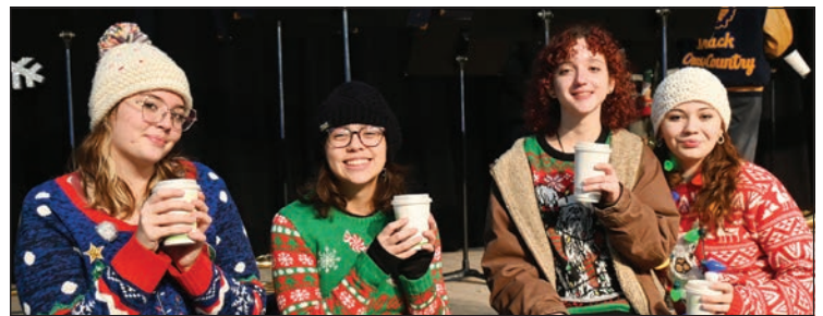
THE ONTARIO HIGH SCHOOL Jazz Band performed at the Lake-side Pavilion at the Columbus Zoo on Dec. 4.

Join the FREE Tribune-Courier Email List and Receive the Weekly Issue Fill Out the Form at http://eepurl.com/hnS9N9